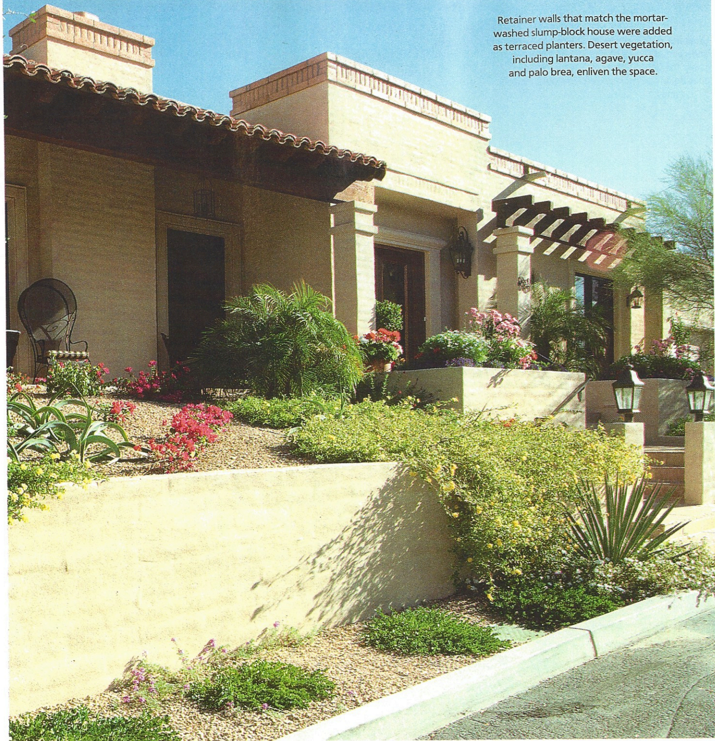
Retainer walls that match the mortar-washed slump-block house were added as terraced planters. Desert vegetation, including lantana, agave, yucca and palo brea, enliven the space.