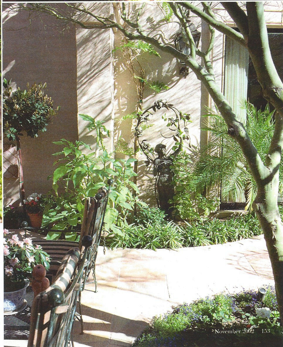
Above: Dining alfresco is a year-round pleasure for Don and Mollie Fry. Backed by Mummy Mountain, their dining area has been enhanced by the addition of a pergola, outdoor lighting and various plantings. • Top, right: Pigmy date palms and blue and yellow pansies border an intricately carved cantera fountain. Right: Outside the master bedroom, an antique lamp illuminates a bed of liriopis.